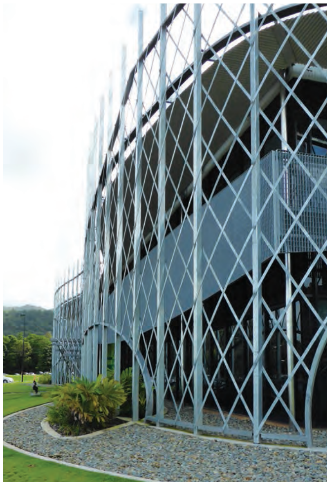
James Cook University

3 HDG coatings thicker than 85µm are not specified in AS/NZS 4680, however in conjunction with the galvanizer, a specification may be written for thicker coatings.