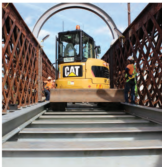
Galvanized stringers being secured to the newly-installed cross-braces.