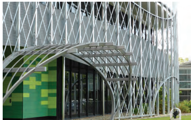
Here the hot dip galvanized trellis combines with a modern skin to complete the building entrance.

This project was awarded Commendations for Interior Architecture and Public Architecture in the 2014 Australian Institute of Architects, Queensland Chapter awards. It was also a GAA 2014 Sorel Award finalist.