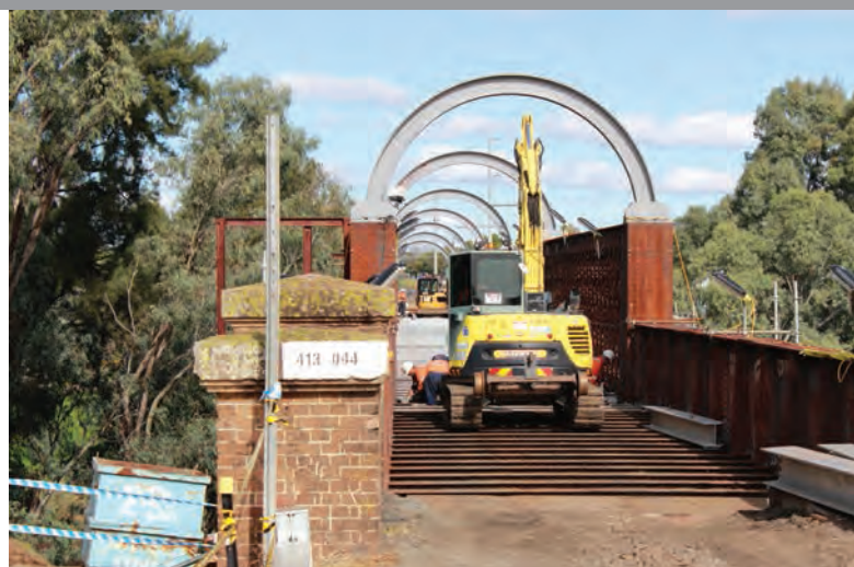
Installation of over 300 galvanized cross-braces required a round-the-clock effort to ensure this vital bridge link was returned to operation on schedule.

Hot Dip Galvanizer: Industrial Galvanizers