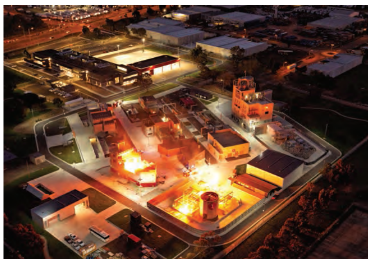
The Victorian Emergency Management Training Centre in action.

This project was the winner of the Australian Institute of Project Management (AIPM) 2014 Project of the Year and 2014 Construction / Engineering project over $100 million. It was also a GAA 2014 Sorel Award finalist.