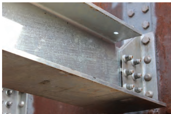
Riveted fasteners were replaced to facilitate speedy removal of the old cross-beams during the 16-day outage.