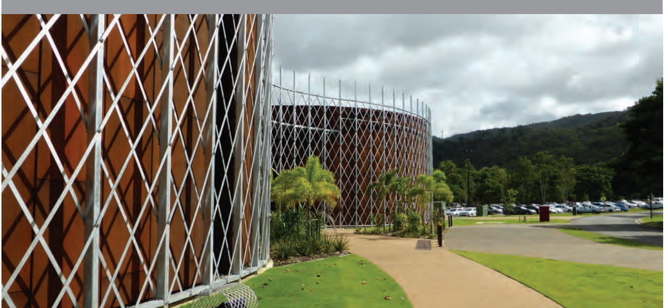
Hot dip galvanizing and weathering steel combine to provide a stunning contrast clearly visible from the nearby main road.

A university building in North Queensland proves once again that hot dip galvanized (HDG) surfaces can lift the appeal of prominent architectural features without additional treatments required.