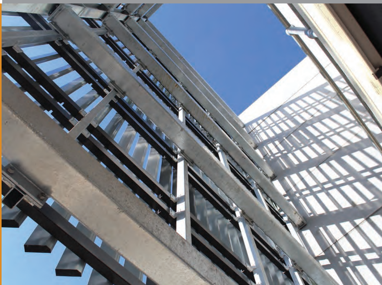
Austin Health – Walton Constructions

As such, it will serve as an essential aid for engineers, architects, specifiers and consultants for many years to come.